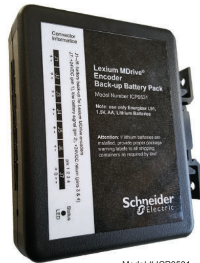
Model # ICP0531